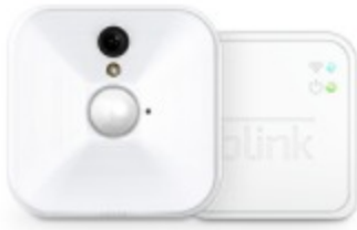
Blink Indoor 1 Camera System