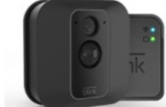
Blink XT2 Camera System