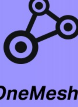
Whole Home Mesh Wi-Fi

Check whether your existing router supports OneMesh™ >>