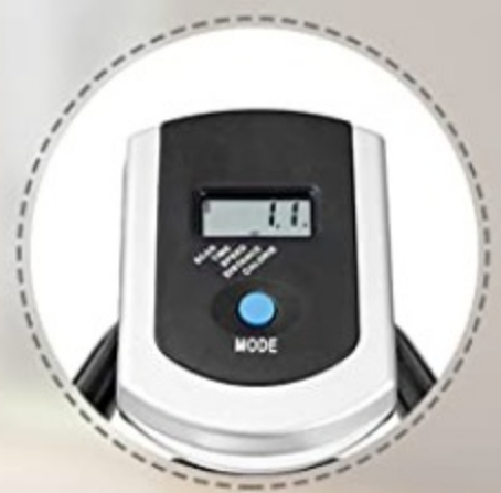
Multi-functional LCD Monitor