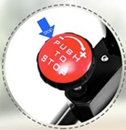
Resistance Adjustment & Emergency Brake