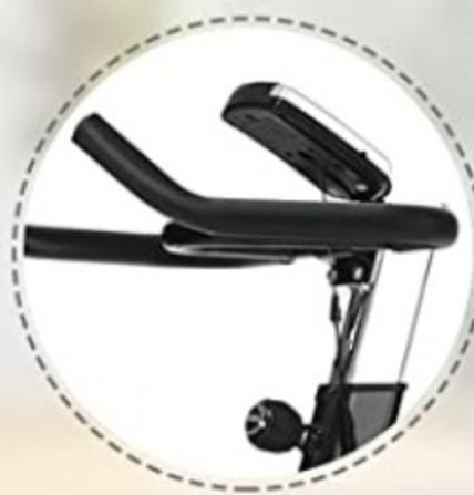
Handlebar with Rubber Cover