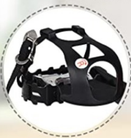
Pedals with Strap