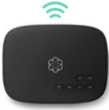
Ooma Telo Air 2